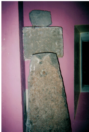
This very large stone is in the entrance to the Eglwys Llannor Church.