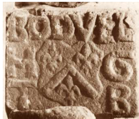
The family name Bodvel is clearly identified in the enlargement of the middle section of the stone.